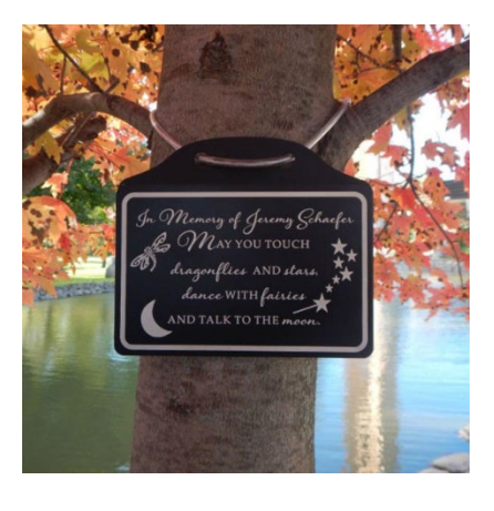
Plaque Option 3